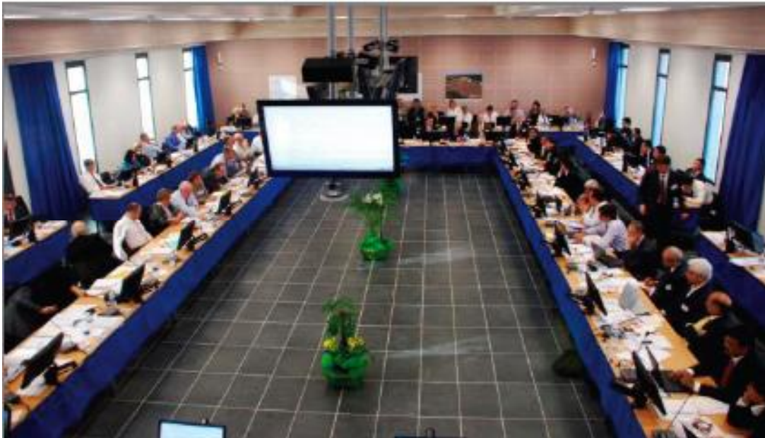
ITER Council meeting in the new conference center room at the Chateau de Cadarache

energy that is respectful of our planet. What is at stake could affect every single person living on Earth, at a time when the world is preparing the Copenhagen Summit on climate change.