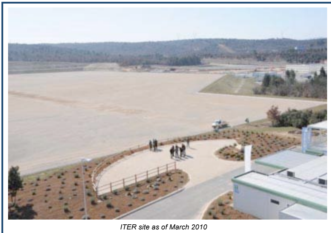
ITER site as of March 2010

Courtesy of the ITER Newsline (April 2 issue), the photograph below, provided by Agence ITER France, shows the ITER site at present, with the Visitor Center at the right and the ITER Headquarters Building in the rear on the right side.