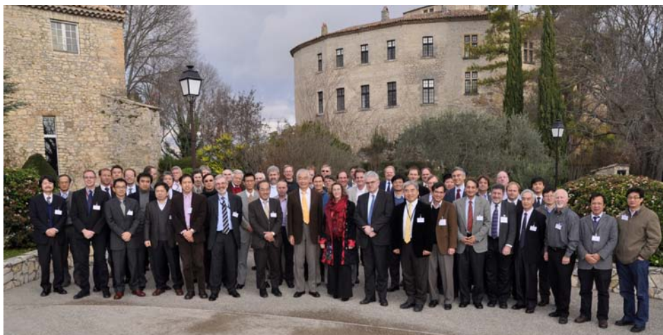
Participants at the December 2011 meeting.